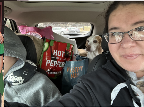
My son & I (along with our 2 dogs) took a road trip back home to Oklahoma for the break to spend with family.